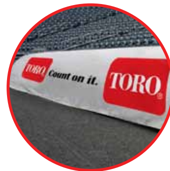
Tarp Roller Advertising